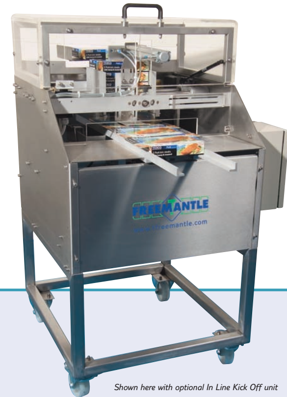
Shown here with optional In Line Kick Off unit